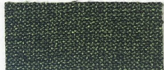
GREEN 68285 (VELA NO. 696)

Renewed Loop is a 100% recycled and recyclable polyester textile from Gabriel (Oeko-Tex Standard 100 & EU Ecolabel). It has outstanding wear resistance on 100,000 Martindale, ensures a very comfortable seating and is easy to clean.