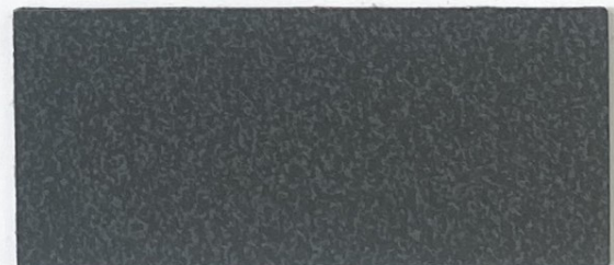
DARK GREY - 0017 (VELA NO. 826)

Compound is an artificial leather from Kvadrat in 100% polyurethane. It has outstanding wear resistance on 100,000 Martindale and excellent breathability, ensuring that the seat does not feel warm. It is water- and oil-repellent and highly cleanable.