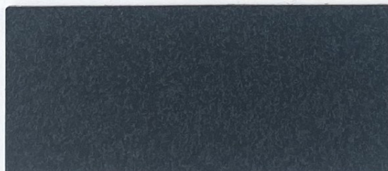
BLACK - 0016 (VELA NO. 825)