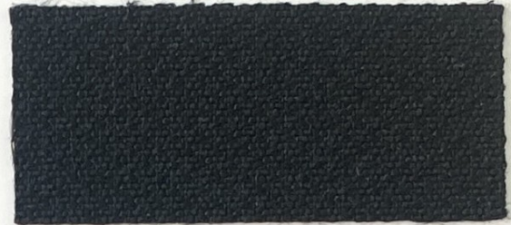
BLACK 60999 (VELA NO. 692)