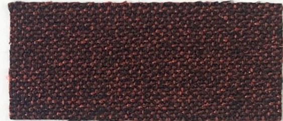
DARK RED 64264 (VELA NO. 694)