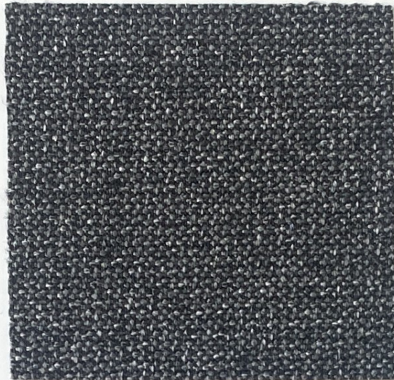
DARK GREY 60341 (VELA NO. 693)